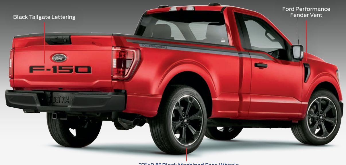
22"x9.5" Black Machined Face Wheels

This special package from Ford Performance is designed to make nearly any 5.0L F-150 a fire-breather!