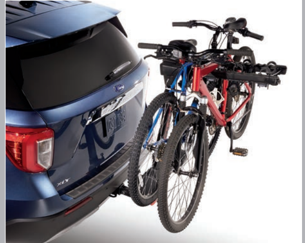
Hitch-Mounted Bike Rack, Swing, Holds 4 Bikes