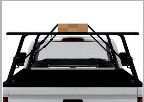
Heavy-Duty Hook Strap