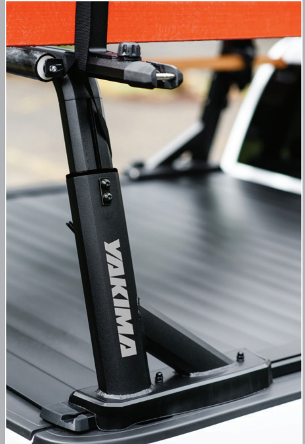
Bed Rack for Embark LS Tonneau/Bed Covers