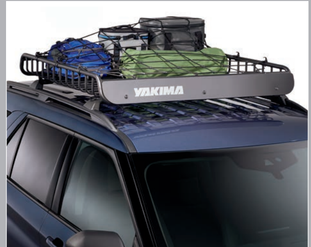
Extra-Large Rack-Mounted Basket