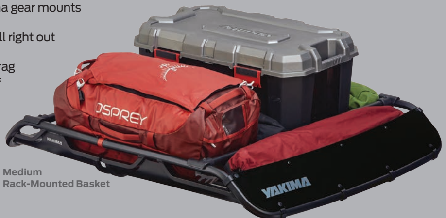
Medium Rack-Mounted Basket