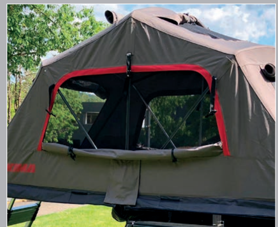
2-Person Heavy-Duty Tent