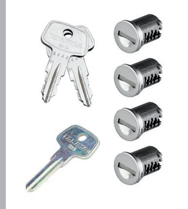
Same Key System Locks