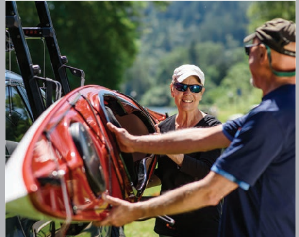
Kayak Carrier with Load Assist