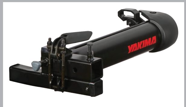
Hitch Swing Adapter