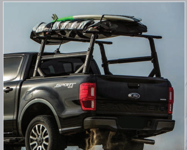
Adjustable Bed Rack