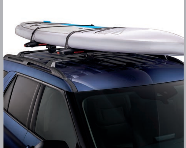
Paddleboard Carrier with Locks