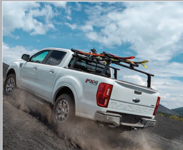
Medium Profile Bed Rack