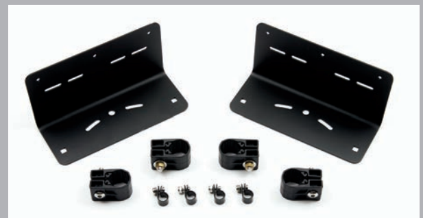
Rack-Mounted Basket Light Brackets