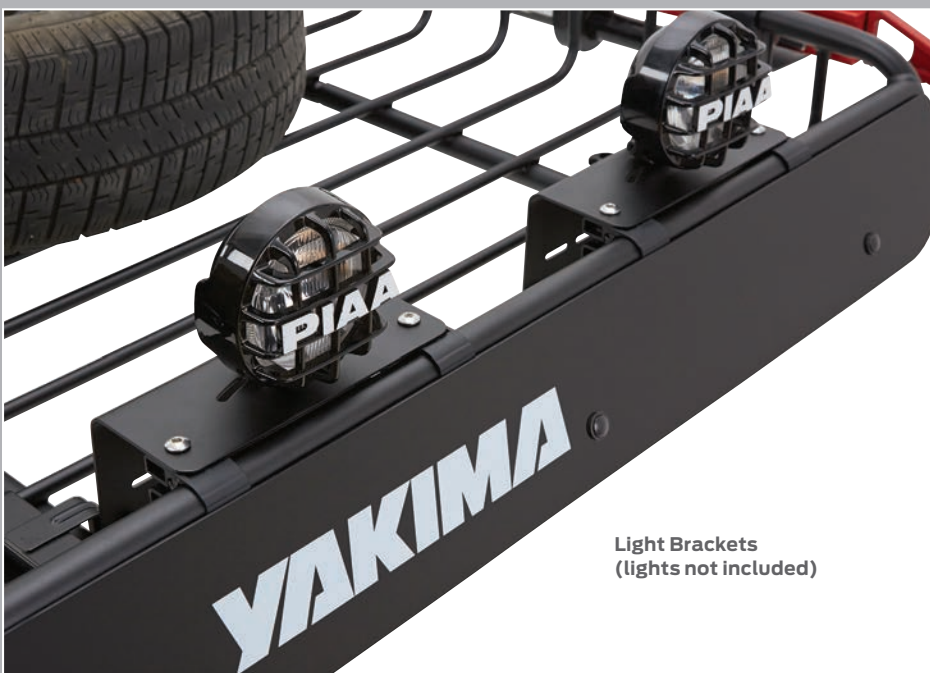
Light Brackets (lights not included)