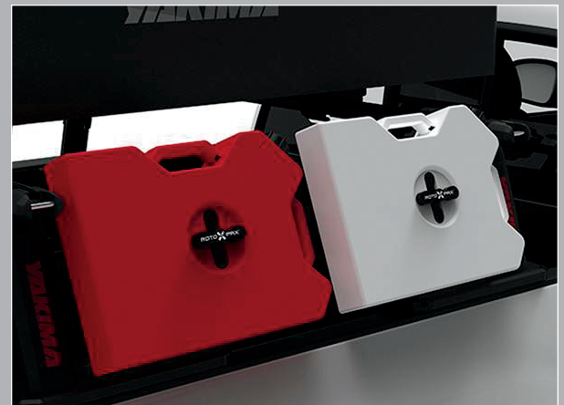
RotopaX™ Mounting Kit