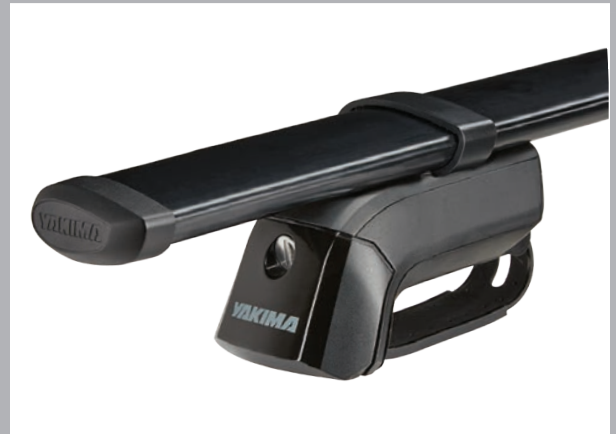
Crossbars for Vehicles with Raised Side Rails