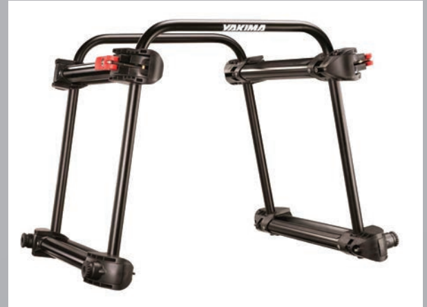
Hitch-Mounted Ski/Snowsport Carrier