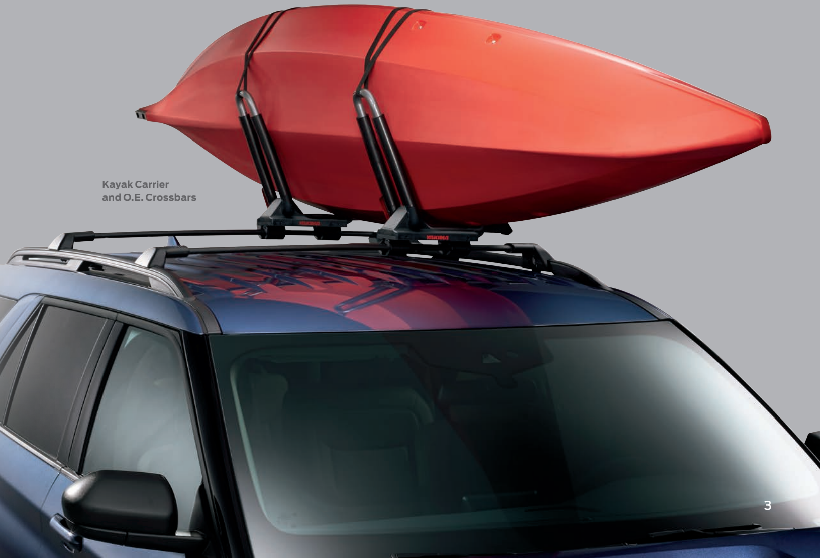
Kayak Carrier and O.E. Crossbars