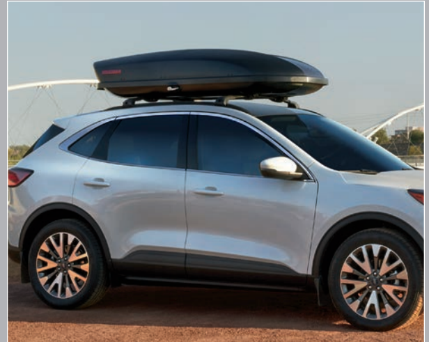
Roof Rack and Crossbar System