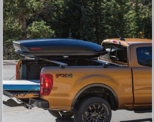
Low-Profile Bed Rack