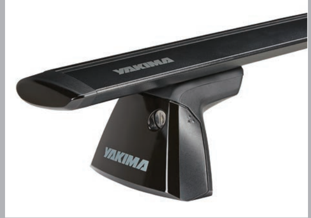
Roof Rack and Crossbar System