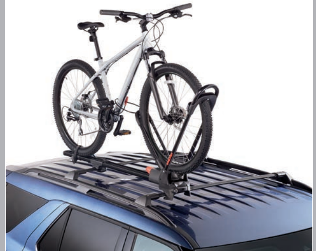
Upright Rack Mount Bike Carrier