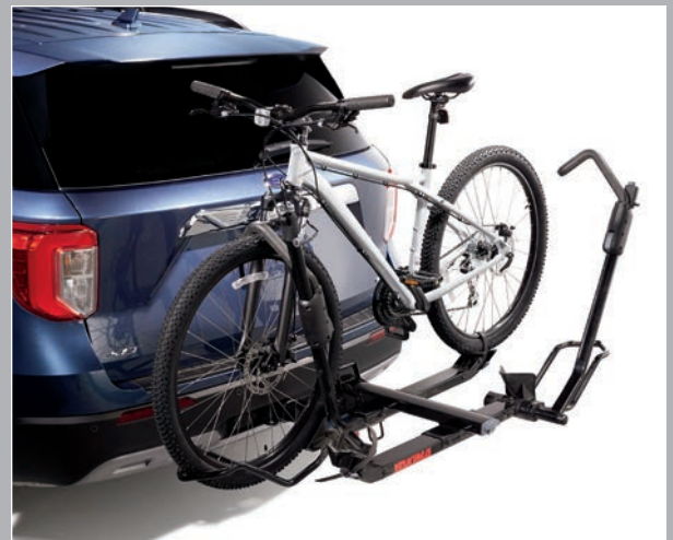
Hitch-Mounted Bike Rack, Tilt, Holds 2 Bikes