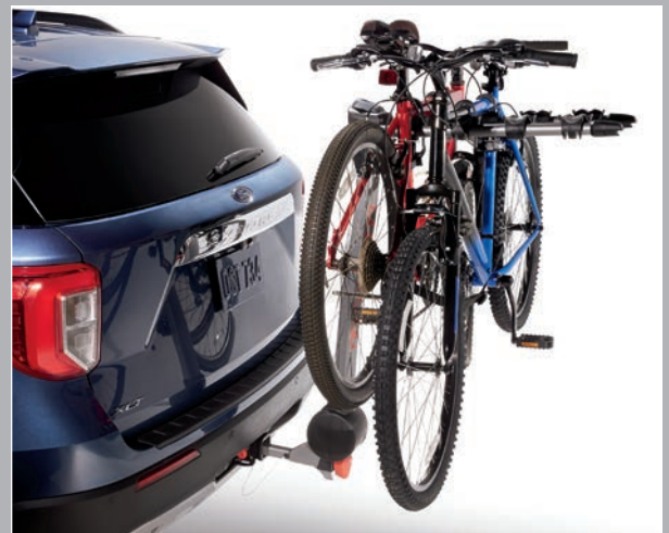
Hitch-Mounted Bike Rack, Tilt, Holds 4 Bikes