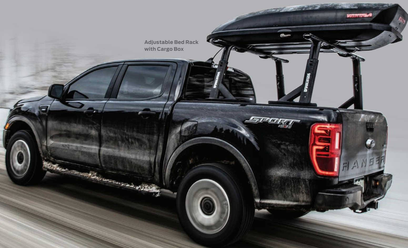
Adjustable Bed Rack with Cargo Box