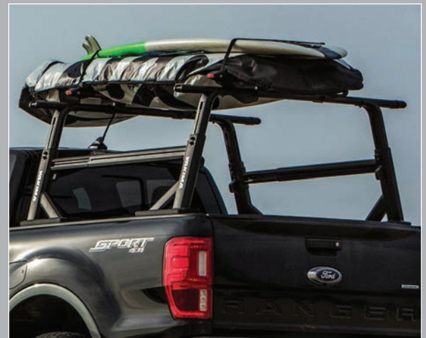
Telescoping Side Bars with Adjustable Bed Rack