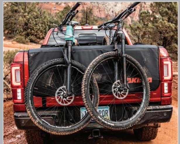
Tailgate Bike Carrier