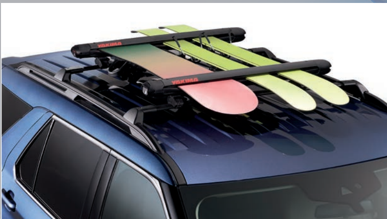
Rack-Mounted Snow/ Snowsport Carrier