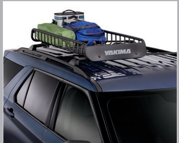
Small Rack-Mounted Basket