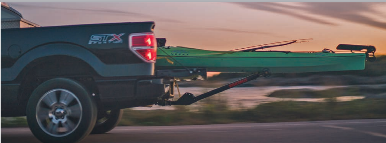
Hitch-Mounted Rack Extension